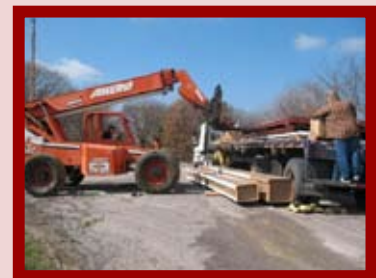
Materials for building being offloaded to adoption center site.

visitors to consider ARFhouse a "Destination" when this building is completed. This Adoption