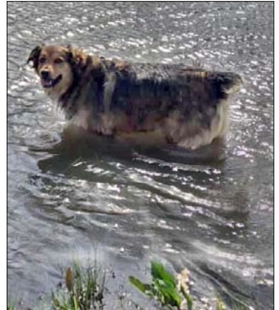
Jazz cooling off in the pond.

Pupdate: in the last issue of our newsletter, I misspoke when I said we had transported over 200 puppies to our partner rescue in Colorado. So far this year, we have transported 107 to LifeLine Puppy Rescue. 107 puppies off the streets, spayed, neutered, and living the life in Brighton!