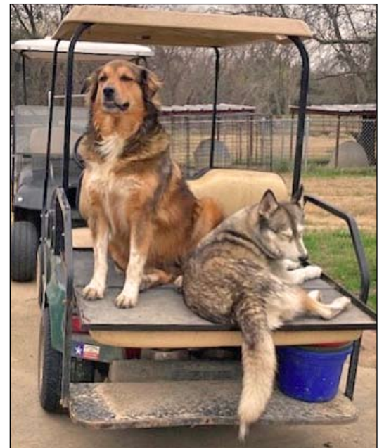
The girls getting ready to work.